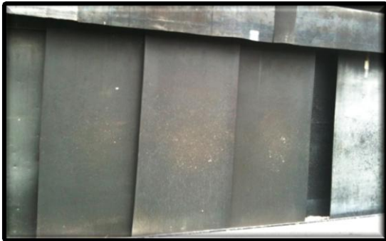
RUTEC R1078 in 6mm