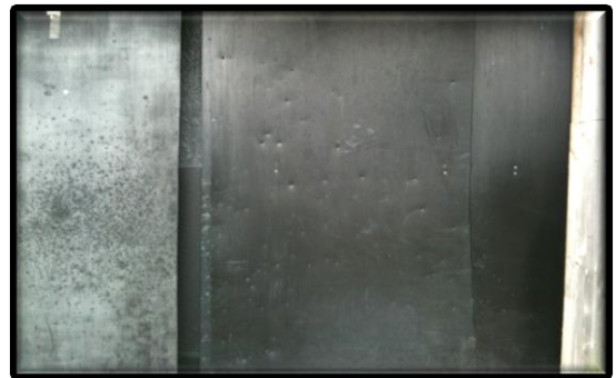
standard-material in 6mm